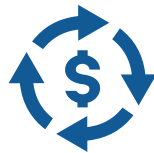
Payment Capture and Processing