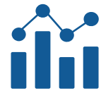
Analytics and Visualizations