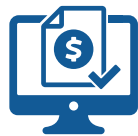
Electronic Bill Payment and Presentment